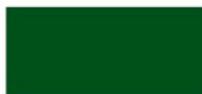
Sanodure Green LWN 1.0 g/l