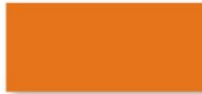
Sanodure Orange G 3.0 g/l