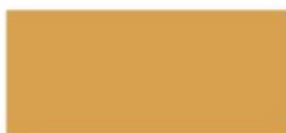
Sanodure Fast Bronze L 0.2 g/l