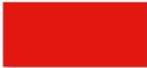
Sanodye Red RLW 2.0 g/l