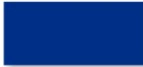
Sanodye Blue 2LW 3.0 g/l