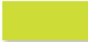
Sanodye Yellow 3GL 3.0 g/l