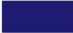
Sanodye Blue G 2.0 g/l