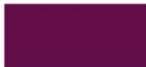
Sanodure Violet CLW 0.3 g/l