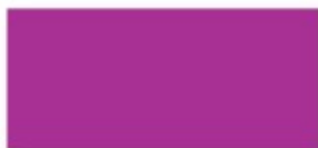
Sanodure Violet CLW 0.1 g/l