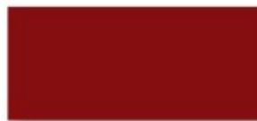
Sanodure Bordeaux RL 5.0 g/l