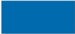
Sanodye Blue G 0.5 g/l