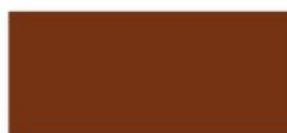
Sanodure Bronze 2LW 1.0 g/l