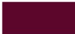
Sanodal Red B3LW 0.5 g/l Sanodure Bronze 2LW 3.0 g/l