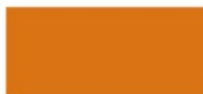
Sanodure Fast Bronze L 0.5 g/l