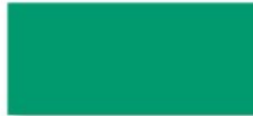
Sanodal Turquoise PLW Liquid 5.0 g/l Sanodye Yellow 3GL 3.0 g/l