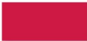
Sanodure Bordeaux RL 0.5 g/l