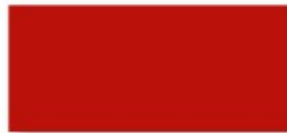
Sanodure Fiery Red ML 5.0 g/l