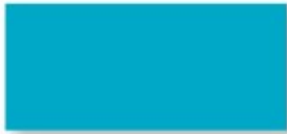
Sanodye Blue 2LW 0.1 g/l